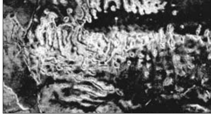
The fur of fetal karakul lambs (left) is lightweight, flat, wavy, and luminous, while that of newborn lambs (below) is tightly curled. Fetal fur usually commands a higher price.