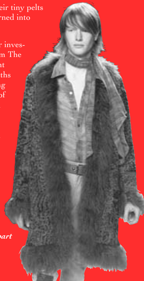
A model sports a karakul lamb coat, part of a fashion designer’s collection.

Undercover investigators from The HSUS spent twelve months documenting the source of this fur and debunking the myths perpetrated by the fur industry.