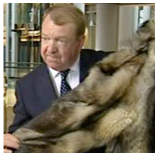
Millions of animals die each year

The ban, which has to be formally approved by EU governments, will apply from 2009.