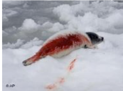
Pups are particularly fluffy

Bärbel Höhn, the Green Party's deputy faction leader in parliament, campaigned for the ban, and said she abhors the methods used to skin seals.