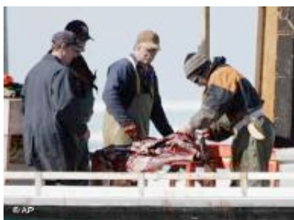
Seal pelts are lucrative business for Canadian fishermen

Other countries like the Netherlands and Belgium have already introduced these measures, she said, with Italy having declared a moratorium.