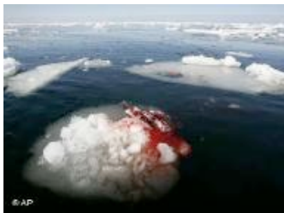
Seal carcasses are often left behind

According to the AP, the Canadian government maintains Canada's seal population is abundant -- with nearly 6 million in the Arctic north and maritime provinces.