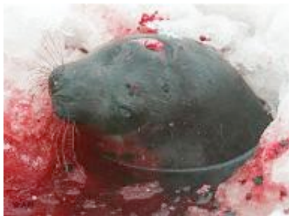
The first day of seal hunt season last year in Canada

Fishermen sell blubber for oil and the seal pelts, largely for the fashion industry, to European countries like Norway, Russia and China.